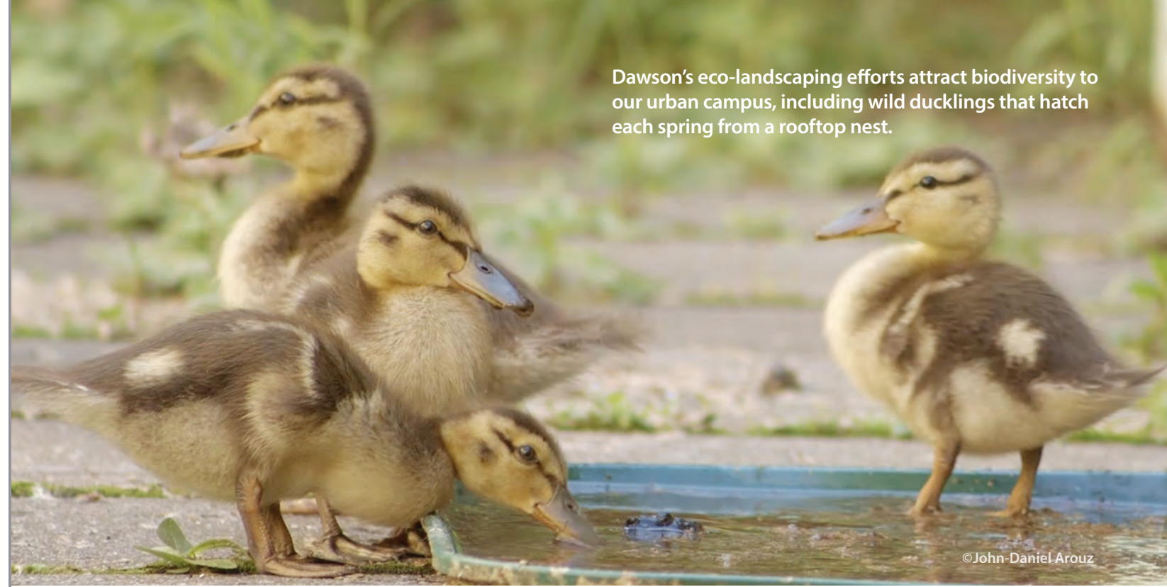
Dawson's eco-landscaping efforts attract biodiversity to our urban campus, including wild ducklings that hatch each spring from a rooftop nest.