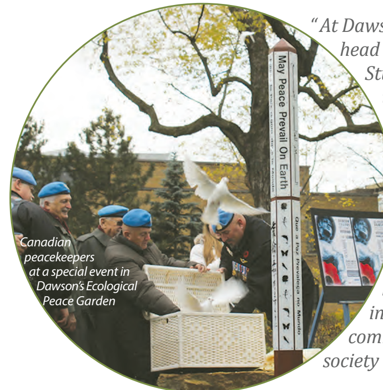
Canadian peacekeepers at a special event in Dawson's Ecological Peace Garden

Several bee colonies are kept on Dawson's rooftops and the honey extracted by students in the fall. Dawson's Campus Life & Leadership team organizes a yearly health challenge for teams of students and staff. Any team participating in physical activity equivalent to 1249 kilometres, the distance 12 female bees fly to make 1 teaspoon of honey, receive a special prize – 1 teaspoon of Peace Garden honey!