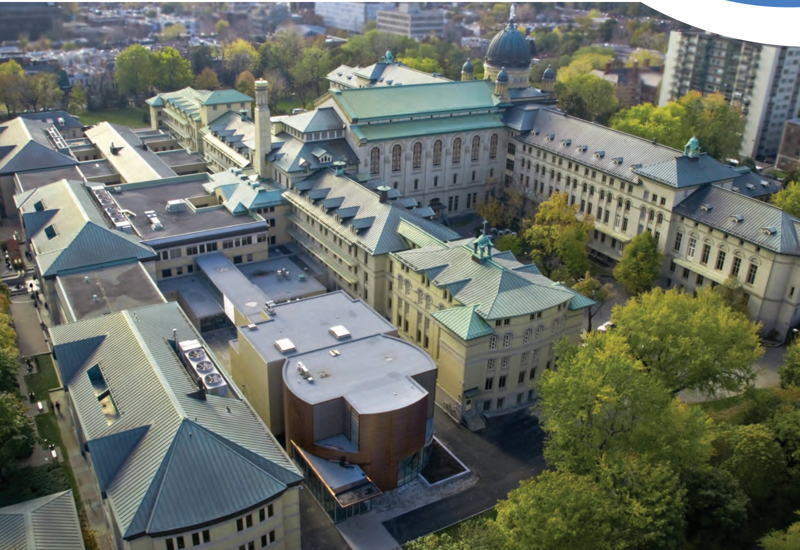
Dawson College moved to the former Mother House of the Congrégation de Notre-Dame in 1988, consolidating all its facilities under one roof.

Dawson College is located in the heart of downtown Montreal in a historic building on 12 acres of green space occupying an entire city block. The College's student population numbers approximately 10,000, with day and evening students enrolled in more than 50 fields of study. It is the largest college (CEGEP) in the province and one of the most attractive, modern and well-equipped colleges in the country.