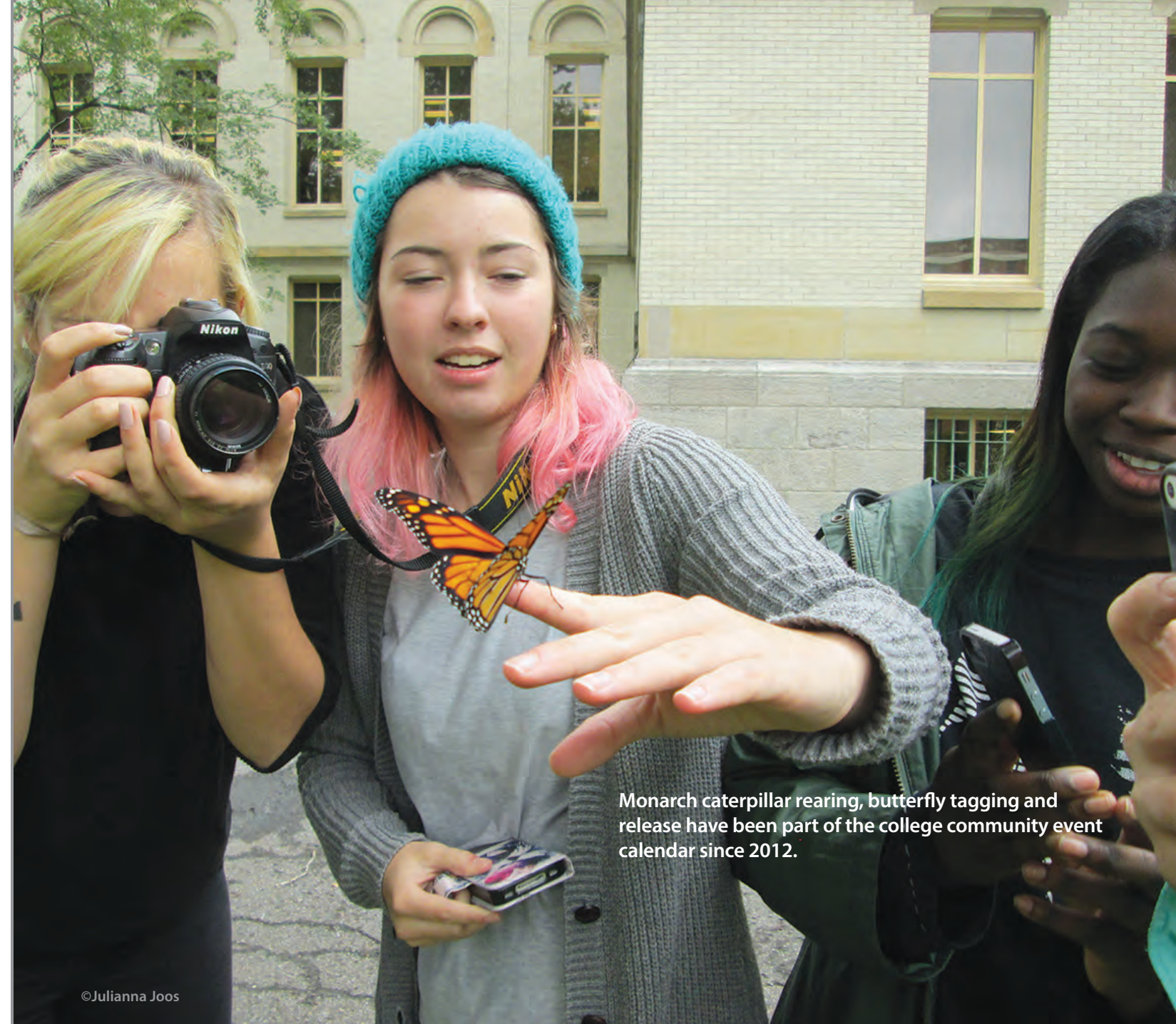
Monarch caterpillar rearing, butterfly tagging and release have been part of the college community event calendar since 2012.